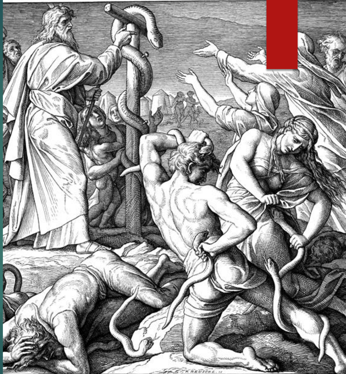
Die von giftigen Schlangen gebissenen Israeliten genesen beim Anblick der ehernen Schlange. Mose eine eherner Schlange und richtete sie auf zum Zeichen, und wenn jemanden eine Schlange biss, so sah er die eherner Schlange an und lebte. IV Mose. Cap. 21. v. 9.

They got sick because they had sinned against God!